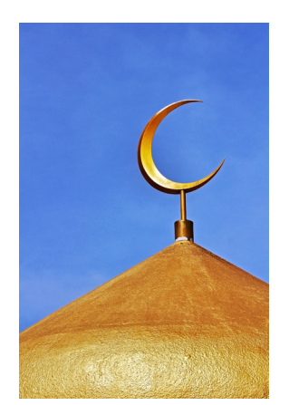
An Islamic crescent moon

All we see in the Islamic world regarding Israel is clips of burning flags, rallies with "Death to Israel" slogans, prayers of destruction in mosques, cartoons depicting Israelis as bloodthirsty demons or villainized Jews in television series and the general indoctrination to hate Jews beginning from kindergarten: In brief, ubiquitous hate propaganda which is heavily ideological. But how much of this has its origins in Islam itself, and will Muslims ever be able to accept Israel as a friendly country and love Jews as fellow human beings?