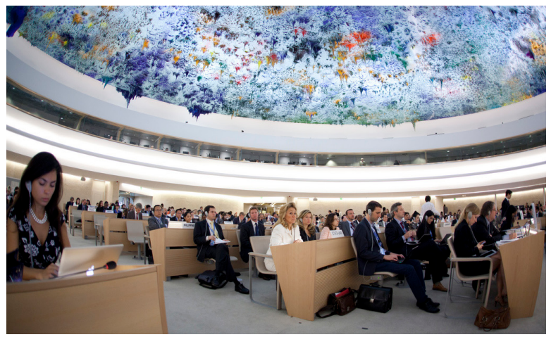
The UN Human Rights Council discusses the situation in Syria, 27 June 2012.

The result today is that many of the UN's political organs, specialized agencies, and bureaucratic divisions have been subverted by a relentless propaganda war against the Jewish state, causing them to stray from their founding purposes and constitutional frameworks.