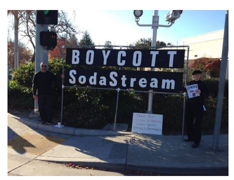
Photo posted on "Friends of Sabeel – North America" Facebook page on Nov. 30, 2013.

These Christians do more than convey a distorted view of life in the Middle East. They encourage Christian institutions to return to a supersessionist expression of the Christian faith. In sum, they encourage Christians in the West, whose churches had, in the aftermath of the Holocaust, started to acknowledge the continued legitimacy of God's covenant with the Jewish people, to abandon this understanding in favor of a more retrograde belief that the Jews are a cast-off people who have been replaced by the Christian church.