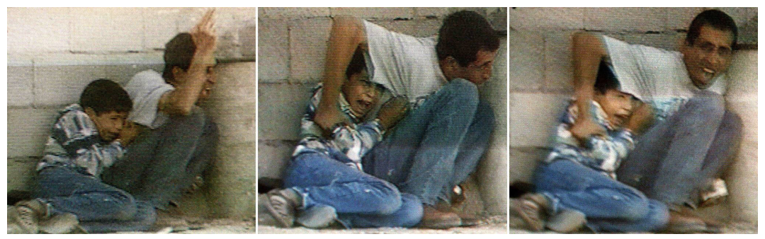
Stills from the Mohammed Al Dura video in a 2000 French news report that led to international criticism of Israel, but drew questions about its veracity.