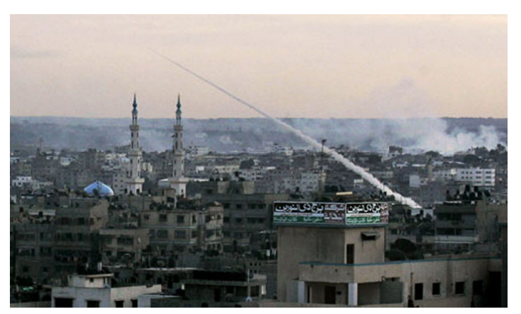
A rocket fired from a densely populated civilian area in Gaza towards Israel

The background of this activity on the part of the UN Human Rights Council was Israel's decision to launch a three-week military campaign, called Operation Cast Lead, on December 27, 2008, in order to reduce significantly, if not eliminate, the indiscriminate rocket