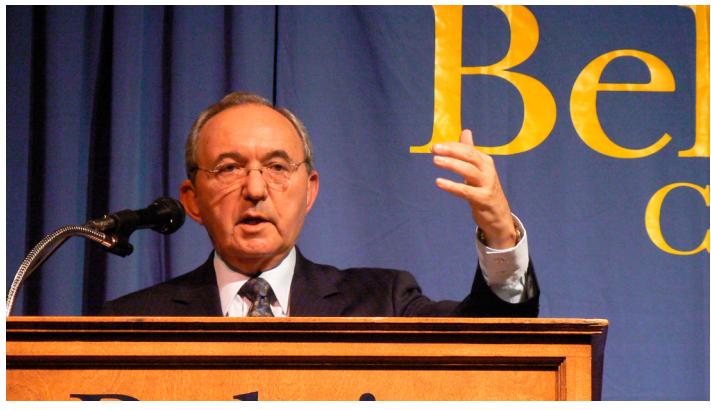
South African judge Richard Goldstone.

When an official UN report is issued, and it makes such baseless charges against a UN member, the UN's own credibility is put into question. For by rejecting his panel's assertion that Israel intentionally killed Palestinian civilians, Goldstone was also rejecting one of the central pillars of the UN Human Rights Council's resolution that commissioned his report to begin with. Thus, the Goldstone Report was not only damaging for Israel, but also for the UN. Those who launched this politicized investigation into Israeli actions in Gaza apparently did not care that the result would ultimately degrade the UN itself.