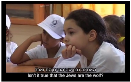
Screenshot from "Camp Jihad" documentary about UNRWA summer camps

Undoubtedly, since its inception nearly sixty-five years ago, UNRWA has accomplished significant major achievements, providing relief and humanitarian aid in one of the most complex geopolitical arenas, under the challenging conditions of political uncertainty and physical insecurity. Nevertheless, within the last few decades, the vast, quasi-state machinery into which the Agency has evolved has attracted considerable criticism. Some of UNRWA's long-standing policies have made it susceptible to political manipulation, in particular by extremist groups. It is evident that the Agency has become deeply involved in Middle-Eastern politics, in a way that might overshadow its significant accomplishments.