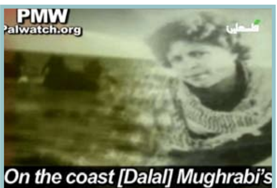
blood was shed.

"The coast was stormy with the glory of Dalal Mughrabi.