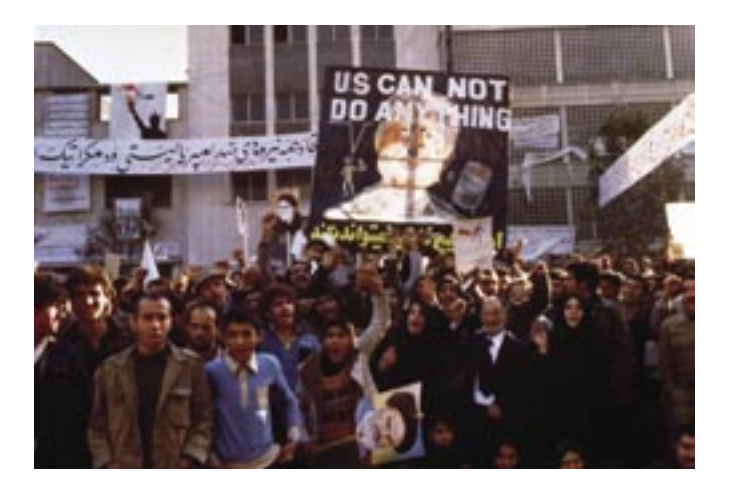
Militant Muslims chanting outside the U.S. Embassy in Tehran, November 8, 1979.

through its Syrian Arab ally and through various terror proxies, in order to pull the region into its orbit of control. The analysis presented here runs counter to the assumption that Iran can somehow be converted into a force for stability in Iraq, Lebanon and other points of tension in the Middle East. A careful assessment of current trends in the regional policies of the Iranian regime, and especially the shifts in its ideological orientation, in fact, point to the very opposite conclusion. As explained below, Iranian policy has deliberately sought to spread chaos in Iraq and in every country where it seeks to undermine current ruling governments.