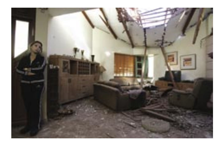
Israeli woman stands in her living room in the southern Israeli city of Sderot after her home was hit by a rocket fired by Palestinians in Gaza, November 26, 2006.

One clear-cut result of this development would be an enhanced threat to the internal stability of Jordan itself. With the growth of Sunni jihadism in western Iraq, al-Qaeda offshoots have already tried to transplant themselves to Jordanian soil in cities like Irbid. An Israeli vacuum in the Jordan Valley would undeniably acceler-