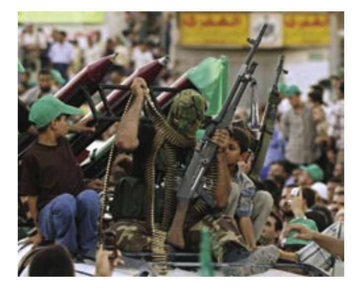
Thousands of Hamas supporters in Gaza City celebrate Israel's unilateral Gaza withdrawal. Masked Hamas gunmen carrying rocket-propelled grenade launchers and assault rifles led the march.

territories and seeking to send them for military training in Syria and Iran.<sup>45</sup>