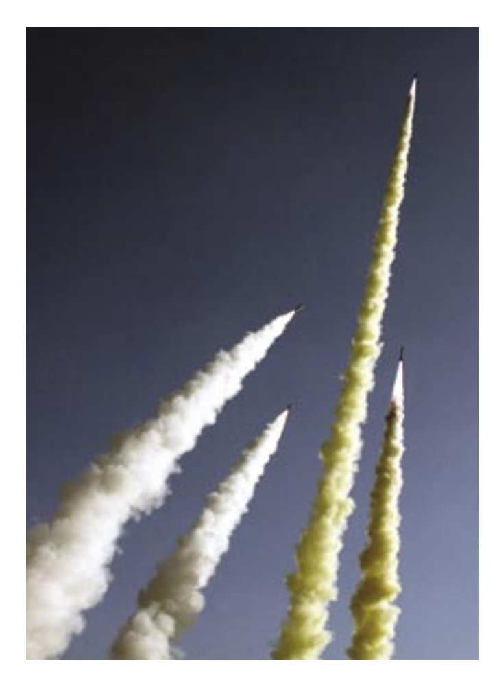
Iran's Revolutionary Guards test missiles including the long range Shahab-3 during maneuvers, November 2, 2006

anti-ship missile, which is very similar to a Chinese antiship missile; the "Fajer 3 radar-evading" missile (probably