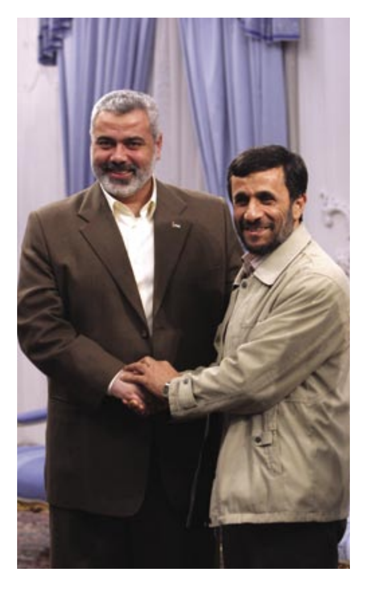
Palestinian Prime Minister Ismail Haniyeh of Hamas with Iranian President Ahmadinejad in Tehran, December 9, 2006. Haniyah returned to Gaza with $35 million in cash stuffed into several suitcases.

Now comes a new myth to replace the old, and it is this: although the Palestinians have an Islamic movement,