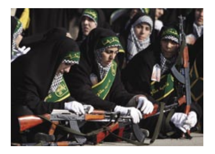
Iranian female paramilitary militias (Basij) at a Tehran rally to support Iran's nuclear program, November 26, 2005.

Iran's targeting Israel as part of its war against the West is emphasized by Ahmadinejad, who told Iran's national news channel on July 26, 2006, "Lebanon is a historic test which will determine the future of humanity....(America) is the one who started this fire. They have collected a bunch of people (the Jews) and put them in the occupied lands to serve as their shield, so they can realize their (American) colonialist domineering goals."<sup>43</sup> In the second week of the Second Lebanon