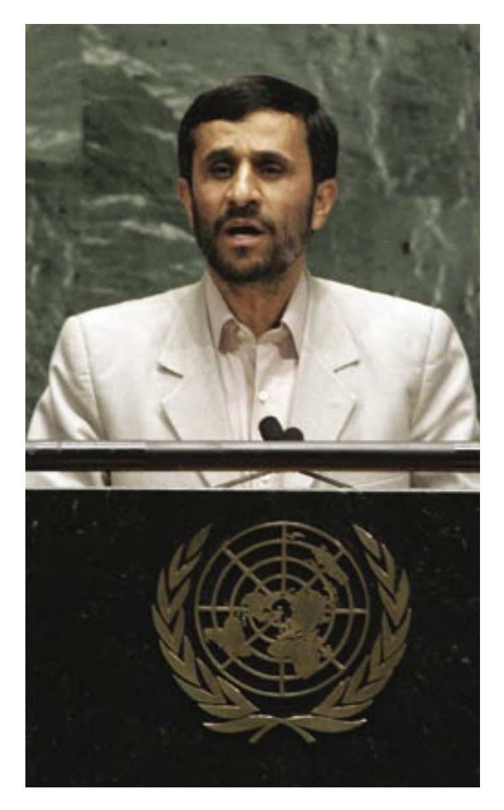
Iranian President Mahmoud Ahmadinejad addresses the 61st session of the UN General Assembly, September 19, 2006.

The international community should not fear the collapse of the PA. The experience of Israel's security op-