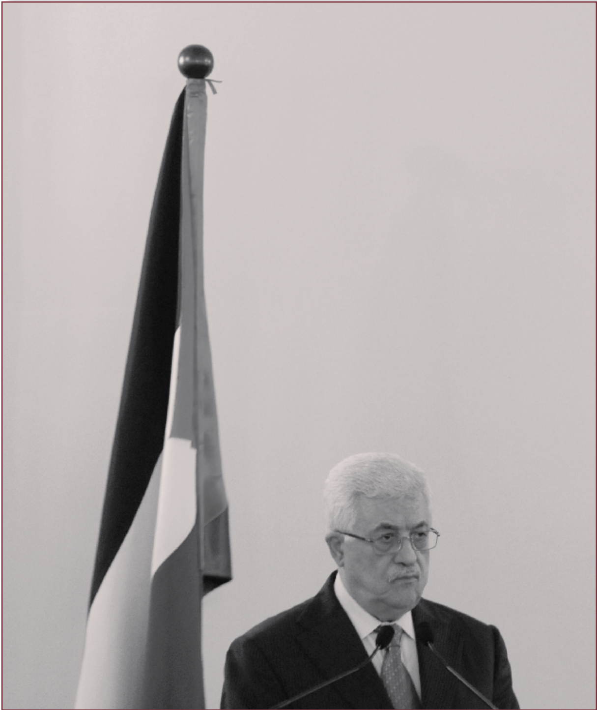
Palestinian President Mahmoud Abbas in Barcelona, Spain, July 20, 2011