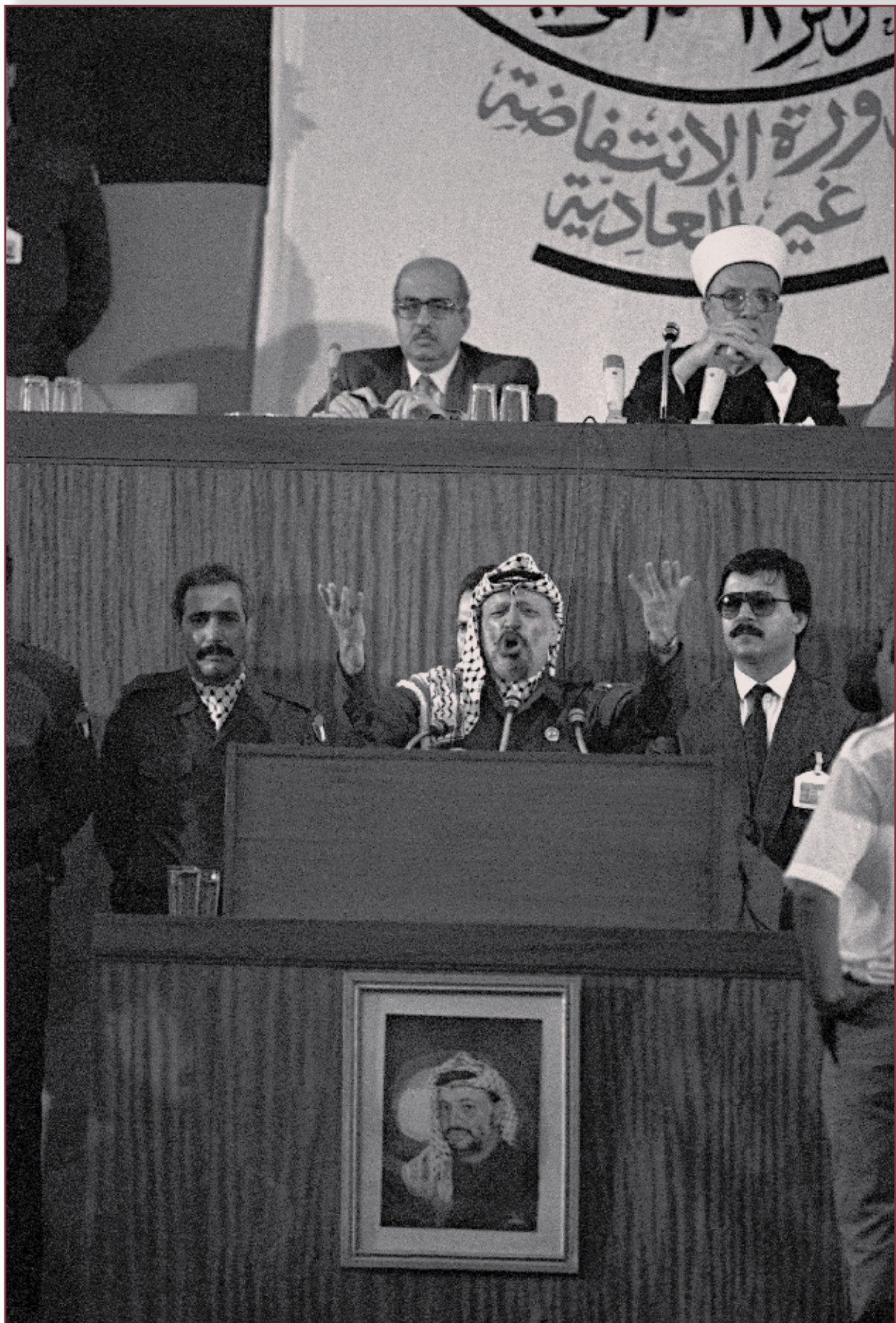
PLO Chairman Yasser Arafat addresses the Palestine National Council in Algiers, November 12, 1988.